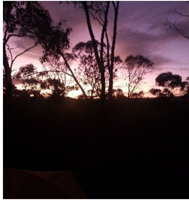
Sunset on the Battery Range