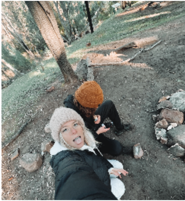
Going for a walk

Here are some images from our latest expedition.