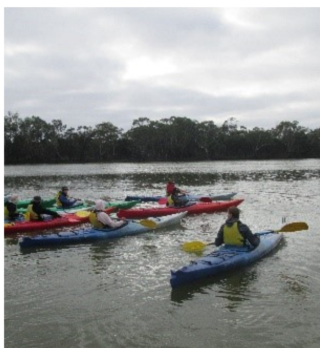
On the Murray River

The Year 11's have been surfing earlier this year and a kayaking expedition in Term 2.